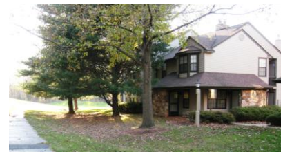
301 Sassafraas Ct.