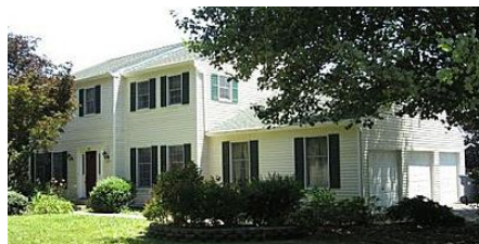
3919 Smoke Rd.

appraisal, 11 different contractors worked on fixing problems. I rented a 2-bedroom condominium in