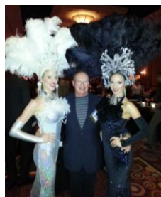
Las Vegas Convention

to walk The Strip, and attended 4 receptions plus a luncheon. Oh—and I spent some time at the convention too.